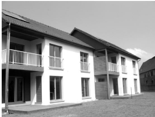
Figure 1: General view of the two houses (Arch.: En Act architecture, contractor: les Airelles)

The building under study is a group of two attached houses built in 2007 in Picardy region, France (Figure1). These houses are the first “Passive-House” buildings in France [1, 8].